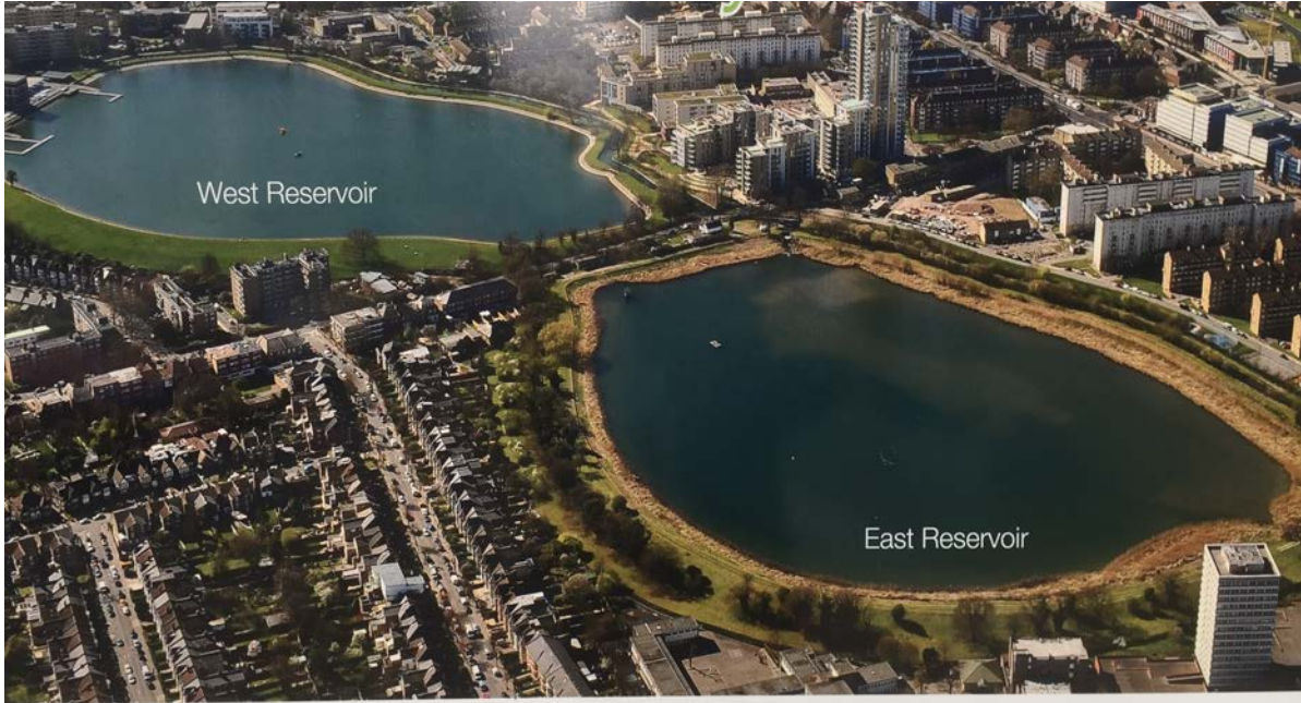
Lordship Rd separates the 2 lakes, that are water reservoirs for London.

This zone in plenty of water reservoirs, small lakes, rivers, and wet areas. It still provides drinking water to the capital.