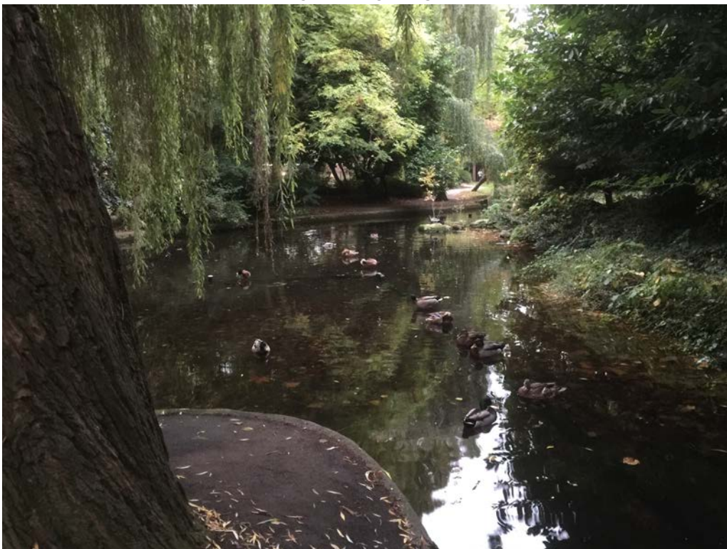
New River, mostly like a rain forest!

It is a joy to explore this small piece of land.