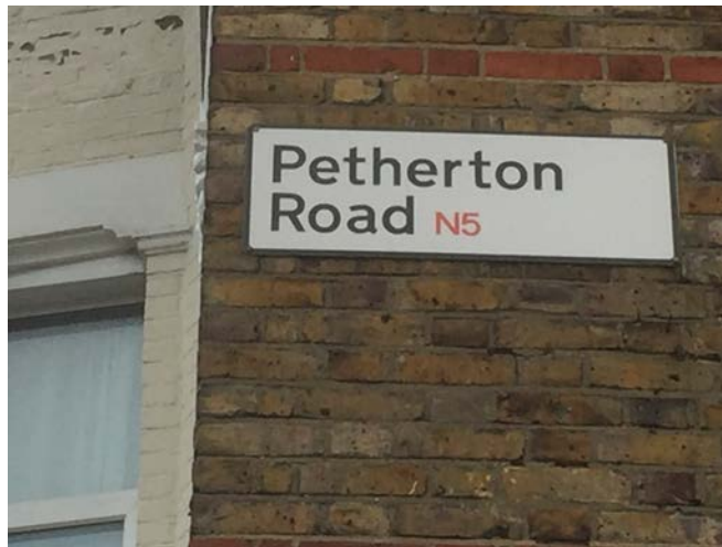
Take Petherton Road

After your visit to these 3 places, take Stoke Newington Church Street, which goes along Clissold Park until you arrive to Green Lanes. Go first on the left and then, at your right, you arrive at Petherton Road.