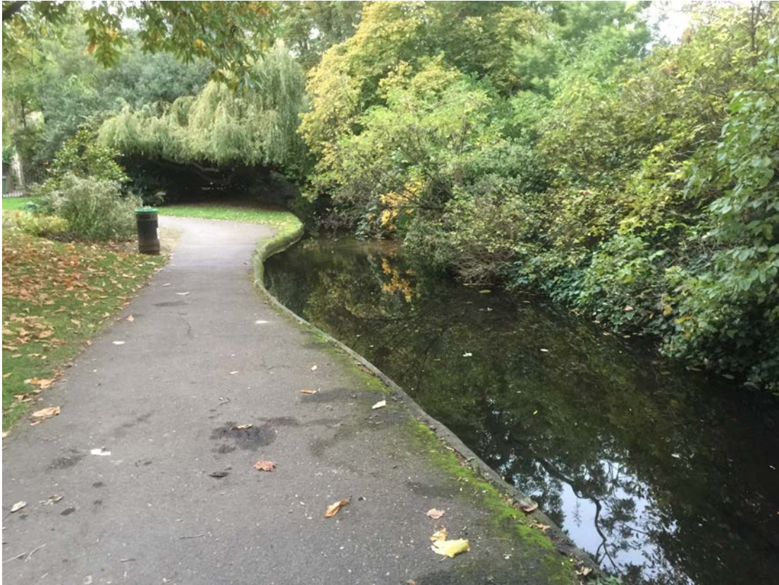
New River walk