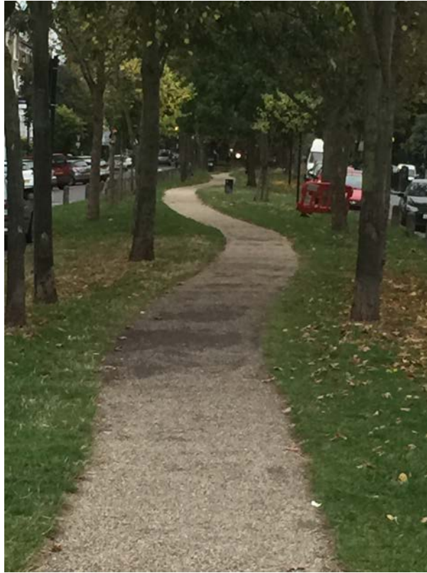
Petherton Road, was once a river.

Or the river that Hugh Myddleton built in 1613 for providing drinkable, fresh water to Londoners.