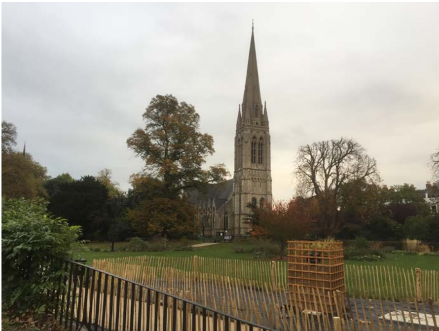
Stoke Newington's new church