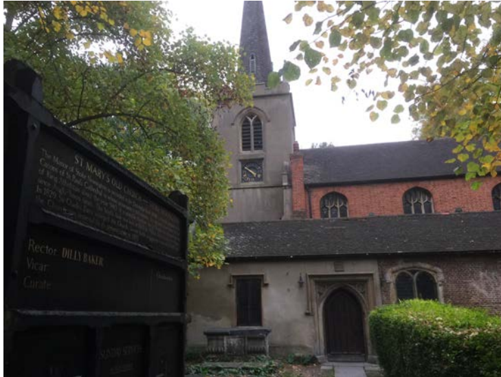
Stoke Newington's old church