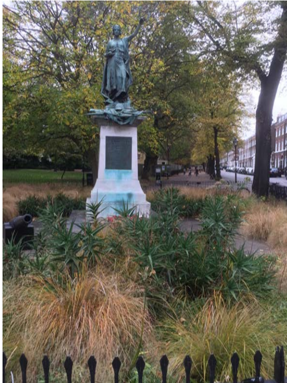
A commemorative monument in Highbury Fields for their dead soldiers, 1899-03.

Just after the Tube station of Highbury and Islington, you arrive to a beautiful park, Highbury Fields, which is the remains of farm fields, that were here until for only 150 years ago.