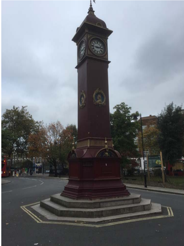
Memorial of Queen Victoria's 60 y reign in Islington Vestry. Great devotion.

Then, start walking through the park until you arrive to Highbury Hill. In front of Christ Church Highbury, you will find a monument to Queen Victoria's 60 years 's anniversary of her reign, 1897.