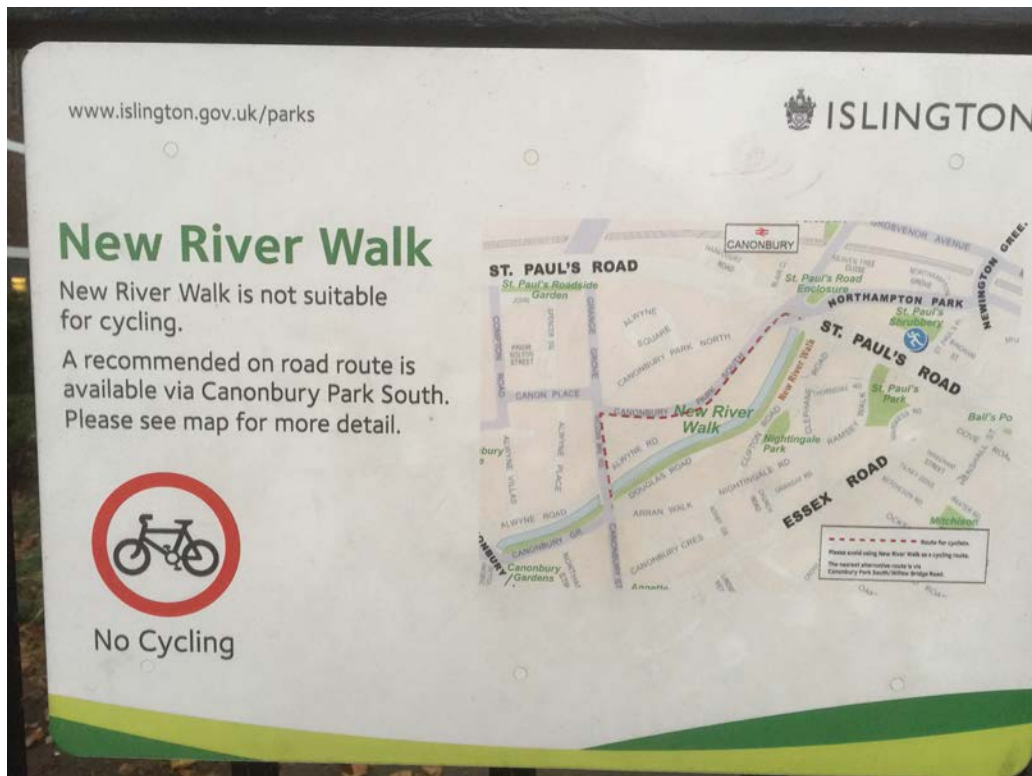
Map of the New River Walk

Carry on to Petherton Rd., it continuous to Wallace Rd and then to St Paul Rd. Cross it and go inside the New River Walk.