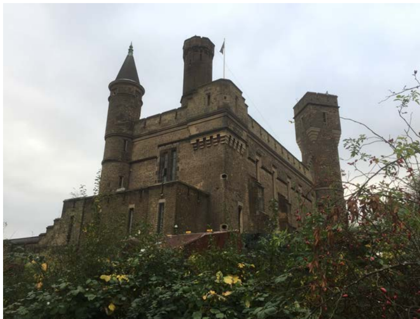
Castle Climbing Centre

After a good, long walk you will arrive to Green Lanes, where you can see a castle, a special one. It is the Castle Climbing Centre. One of the largest indoor climbing centres in Britain, if you like this sport.